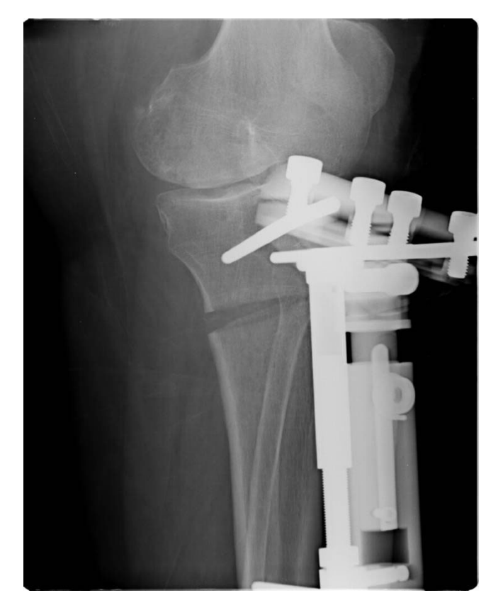
Figure 2 Radiograph of high tibial osteotomy using the hemicallotasis technique.

The association between preoperative knee alignment (HKA angle) and preoperative knee pain (KOOS subscale pain), and change in knee alignment with surgery (the difference between preoperative HKA angle and postoperative HKA angle) and change in knee pain over time was assessed by simple regression analyses. Multiple regression